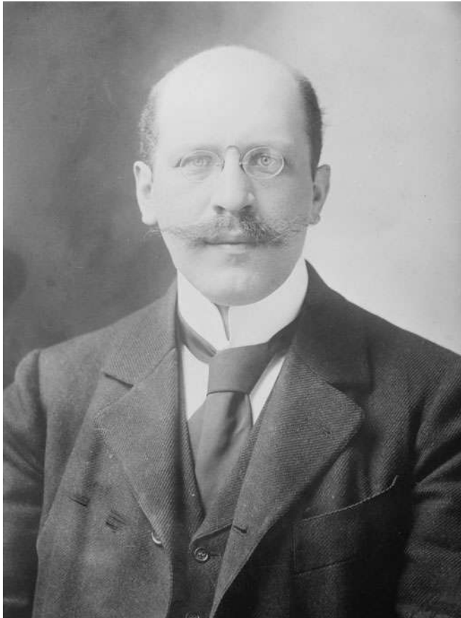
1. Hugo Munsterberg, who wrote one of the first forensic psychology books, titled On the Witness Stand: Essays on Psychology and Crime

medical qualifications, studying human actions and experiences as a scientific discipline. Some psychologists go on to specialize in working with people who are mentally disturbed. Such psychologists are typically called 'clinical psychologists', and work