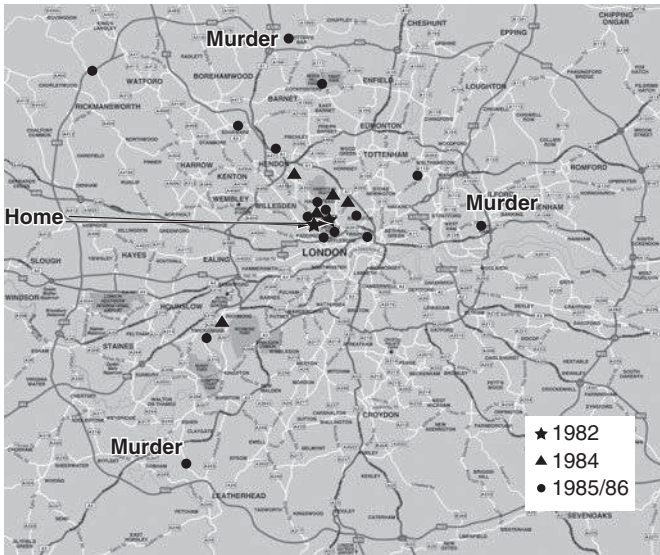
13. A map of the locations of a crime series with the location of the offender's home indicated

which they chose to offend for this to be a useful starting point for trying to work out where the offender lives.