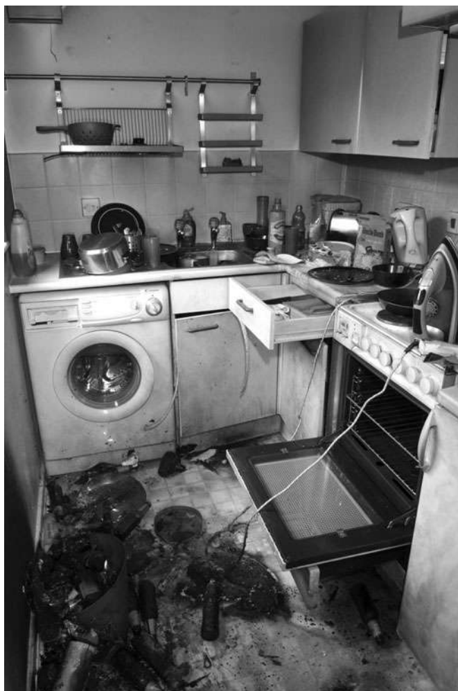
10. Photograph of a murder crime scene